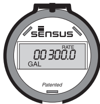
Rate of Flow Mode